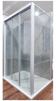
SHOWER SCREEN HARDWARE 6MM SLIDING - KNOBS/HANDLES: TAPERED