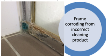
Shower Screen Cleaning Guide

(Please refer to Cleaning Caveat page 8 for more details).